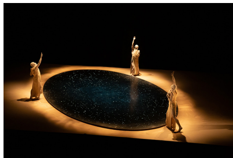
Sankai Juku "TOBARI—As if in an inexhaustible flux"

The official programs that form the core of the Toyooka Theater Festival are the "Director's Program", selected by the Festival Director, Oriza Hirata and the "Festival Produce" that expands the possibilities of the performing arts.