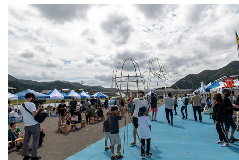
Takeno Uimachi Market