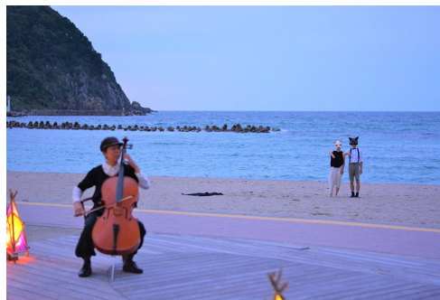
Takeno — One of the Best Beaches

Artist-in-residence facilities specializing in performing arts at the Kinosaki International Arts Center (KIAC) and local ryokan (Japanese-style hotels) serve as venues for the Toyooka Theater Festival. There are many sightseeing spots such as the Genbudo Caves and Kinosaki Ropeway.