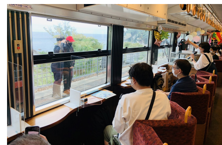
Collaboration with Tourism