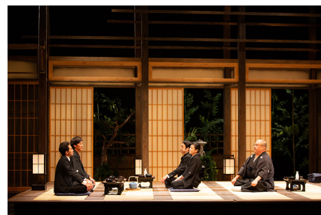
Seinendan "The Rise and Fall of Japanese Literature"