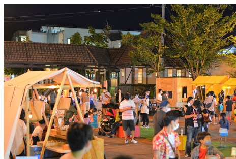
The Festival Night Market

The annual festival night market sells local foods and products.