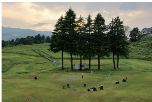
Kannabe, Hidaka — Popular Resort

The area is the key to local transportation. Built in 1935, the former Hidaka town hall was rebuilt as the "Ebara Riverside Theatre" (ERST) in 2020 and is equipped with a theater and studio which are used as a venue for the Toyooka Theater Festival.