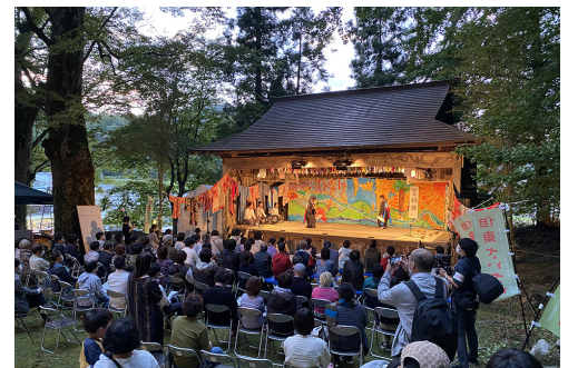
Tanto — Village Surrounded by Nature

Eirakukan, the oldest theater in Kansai, and the Izushi Castle Ruins overlooking the cityscape are the venues of the Toyooka Theater Festival.