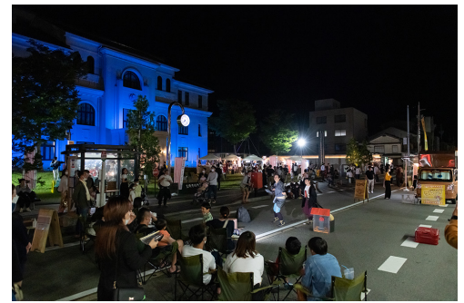
Toyooka — Downtown Area of Toyooka City

There are many modern buildings that were rebuilt after the 1925 earthquake in the center of Toyooka City. By crossing the Maruyama River, the countryside spreads out, and you can see wild Oriental White Storks, the symbol of the area. The Professional College of Arts and Tourism (CAT), which opened in 2021, is also used as a Toyooka Theater Festival venue.