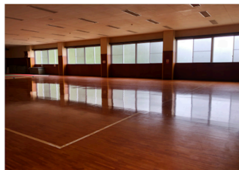
Blue Sea and Green Land Takeno