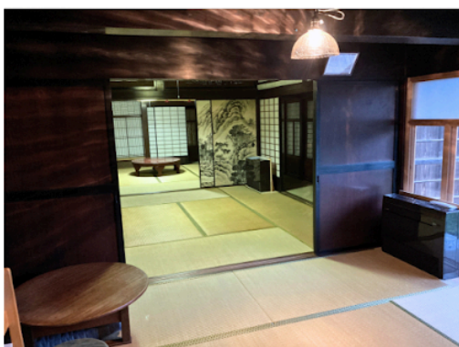
Oishi family housing (Oisike Jutaku)