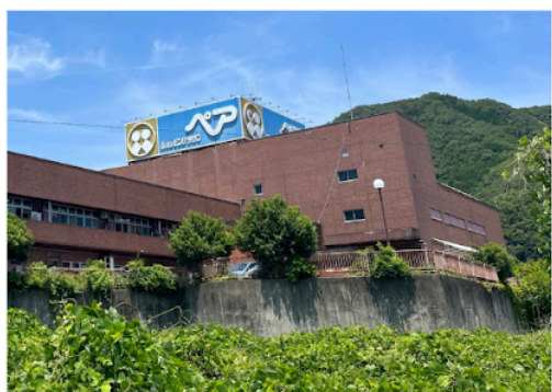
Shopping Town Pair