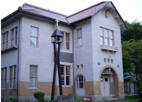
Catholic Toyooka Church

*The venues listed here are only a part of the designated venues.