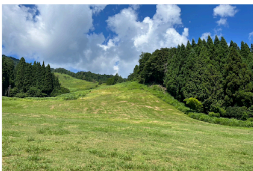
Former Nashiki Ski Resort (Kyu Nashiki Ski Resort)