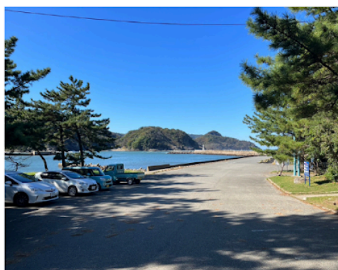
Takenohama Beach (Takenohama Kaisuiyokujo)